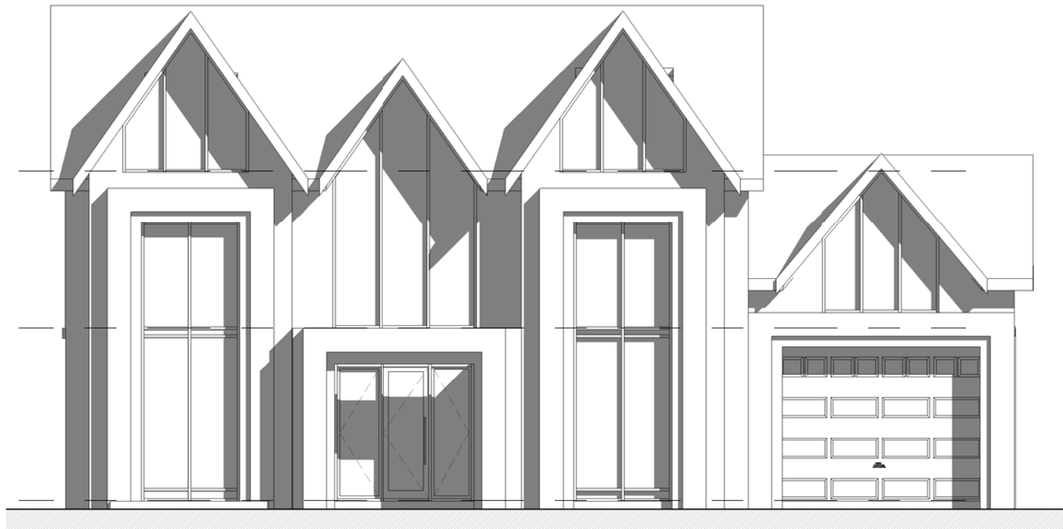
1 Front - Proposed 1:100

Unless specifically specified these drawings are not to be used for construction purposes or placing of any orders.