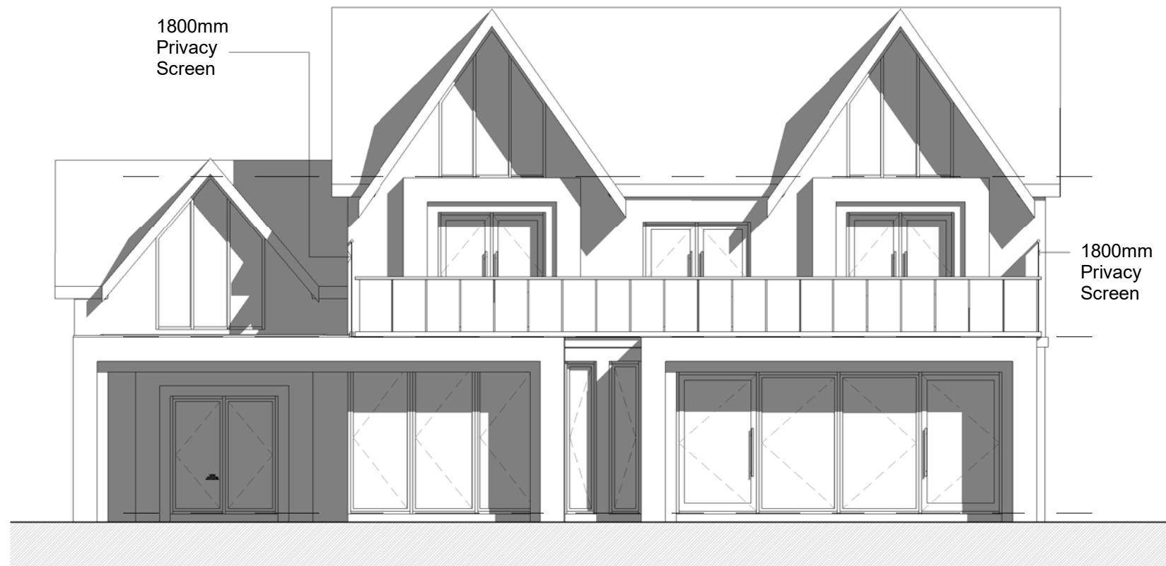
1 Rear - Proposed 1 : 100

Unless specifically specified these drawings are not to be used for construction purposes or placing of any orders.