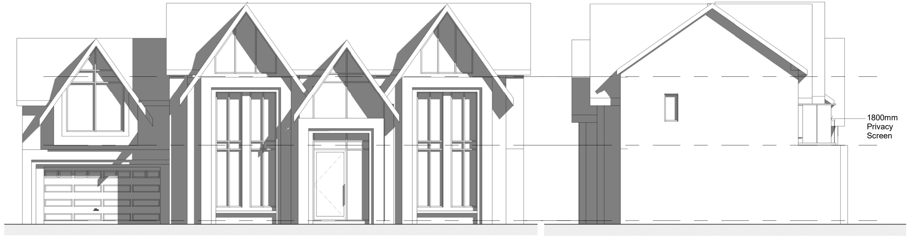
① Front - Proposed 1:100

Unless specifically specified these drawings are not to be used for construction purposes or placing of any orders.