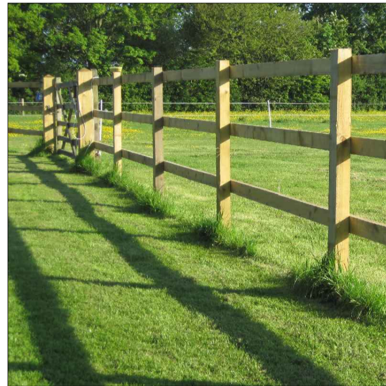
Photo 1.2 - Timber Lincolnshire Post and Rail Fencing to Rear of Properties