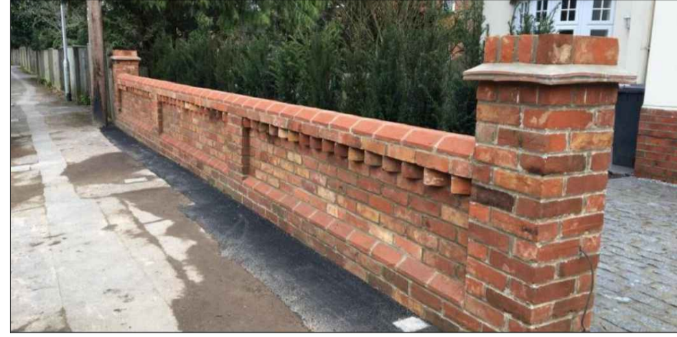
Photo 1.0 - Typical Approved Facing Brickwork Wall and Piers to Property Frontage