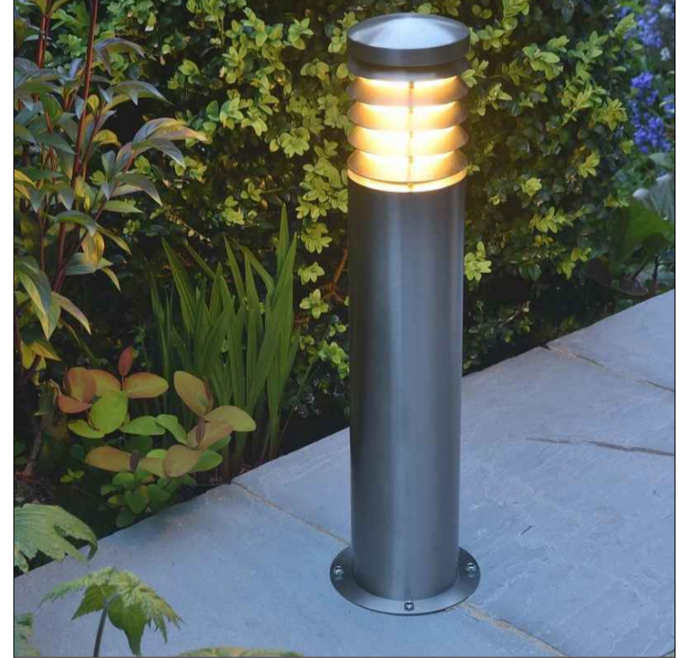
Photo 1.3 - Typical example of contemporary Lighting Bollards proposed to each property Driveway Entrance