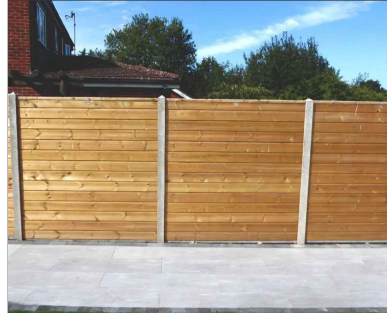
Photo 1.1 - Horizontal close boarded timber fence and posts, between properties