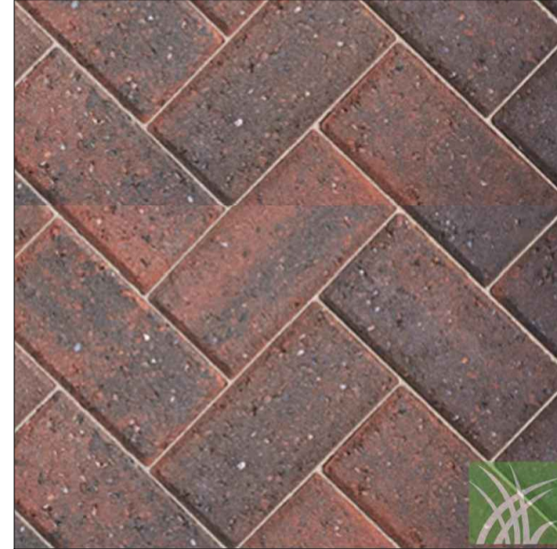
Photo 1.5 - Typical example of Permeable Brickwork Paviers in Brindle colour