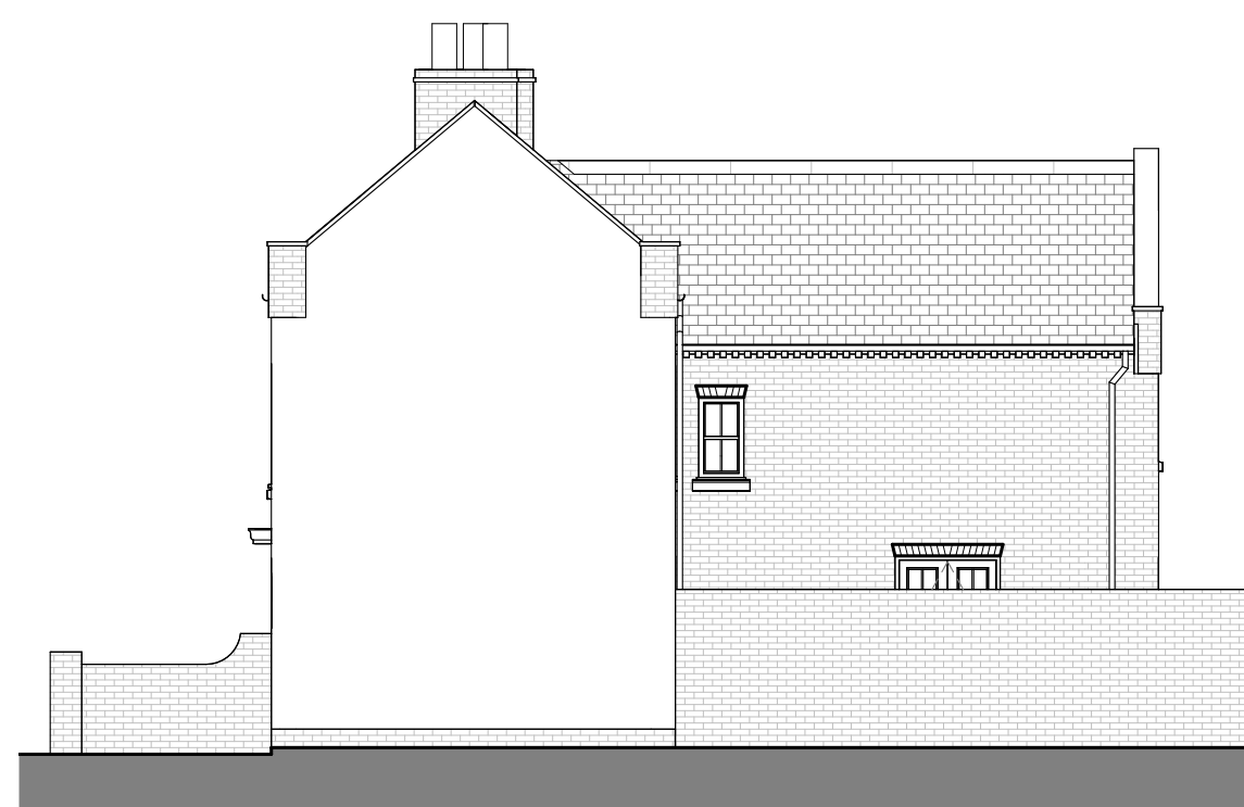
EXISTING WEST ELEVATION 1 : 100