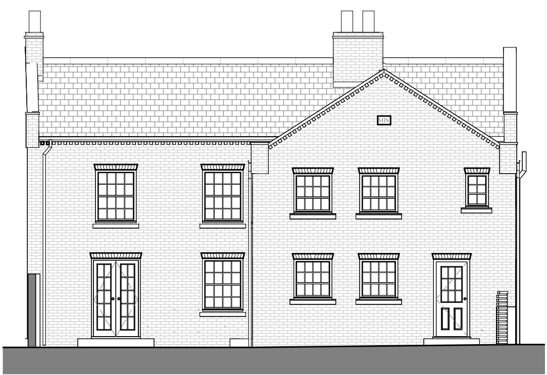
EXISTING SOUTH ELEVATION 1 : 100