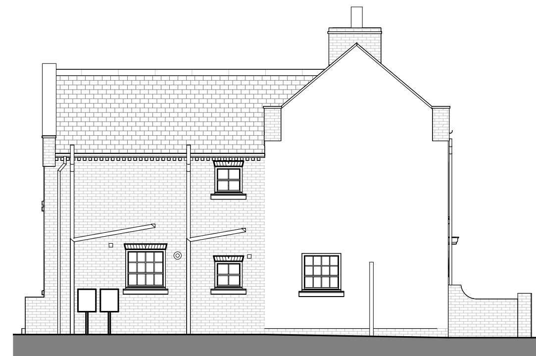
EXISTING EAST ELEVATION 1 : 100

PLEASE NOTE DO NOT scale from this drawing, use figured dimensions only. All dimensions to be checked on site by the contractor. Please report any discrepancies to JHA Architecture Ltd immediately. All setting out dimensions are approximate. To be marked out on site for approval by JHA Architecture Ltd prior to construction.