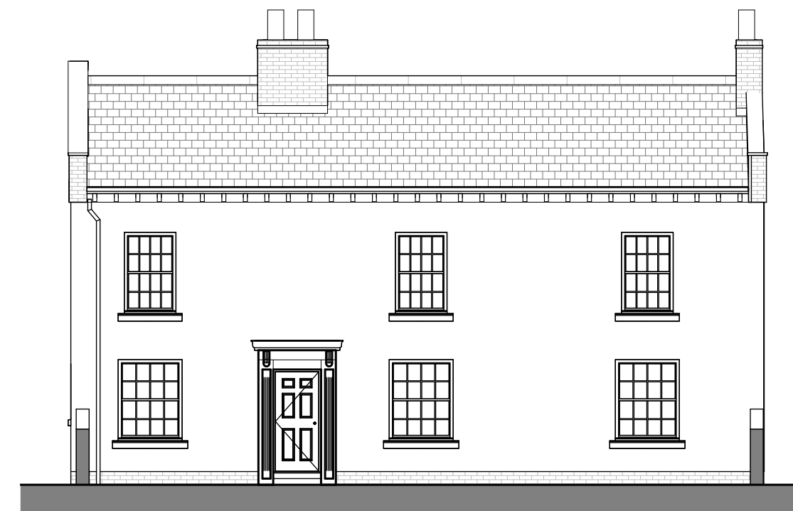
EXISTING NORTH ELEVATION 1 : 100