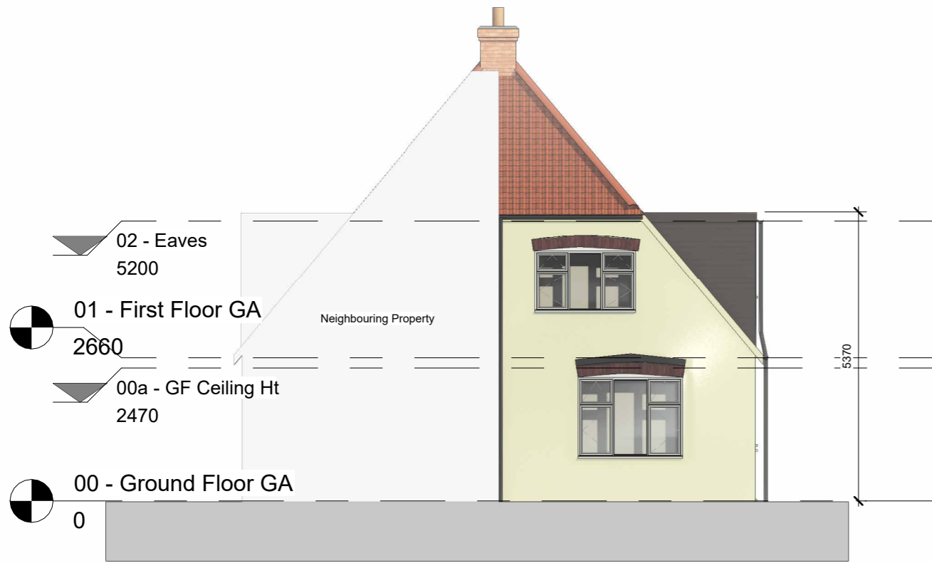
1 Existing East Elevation 1 : 100