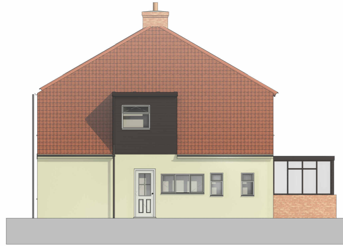
2 Existing North Elevation 1 : 100