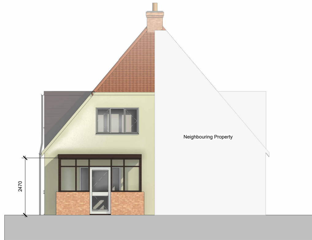
3 Existing West Elevation 1 : 100