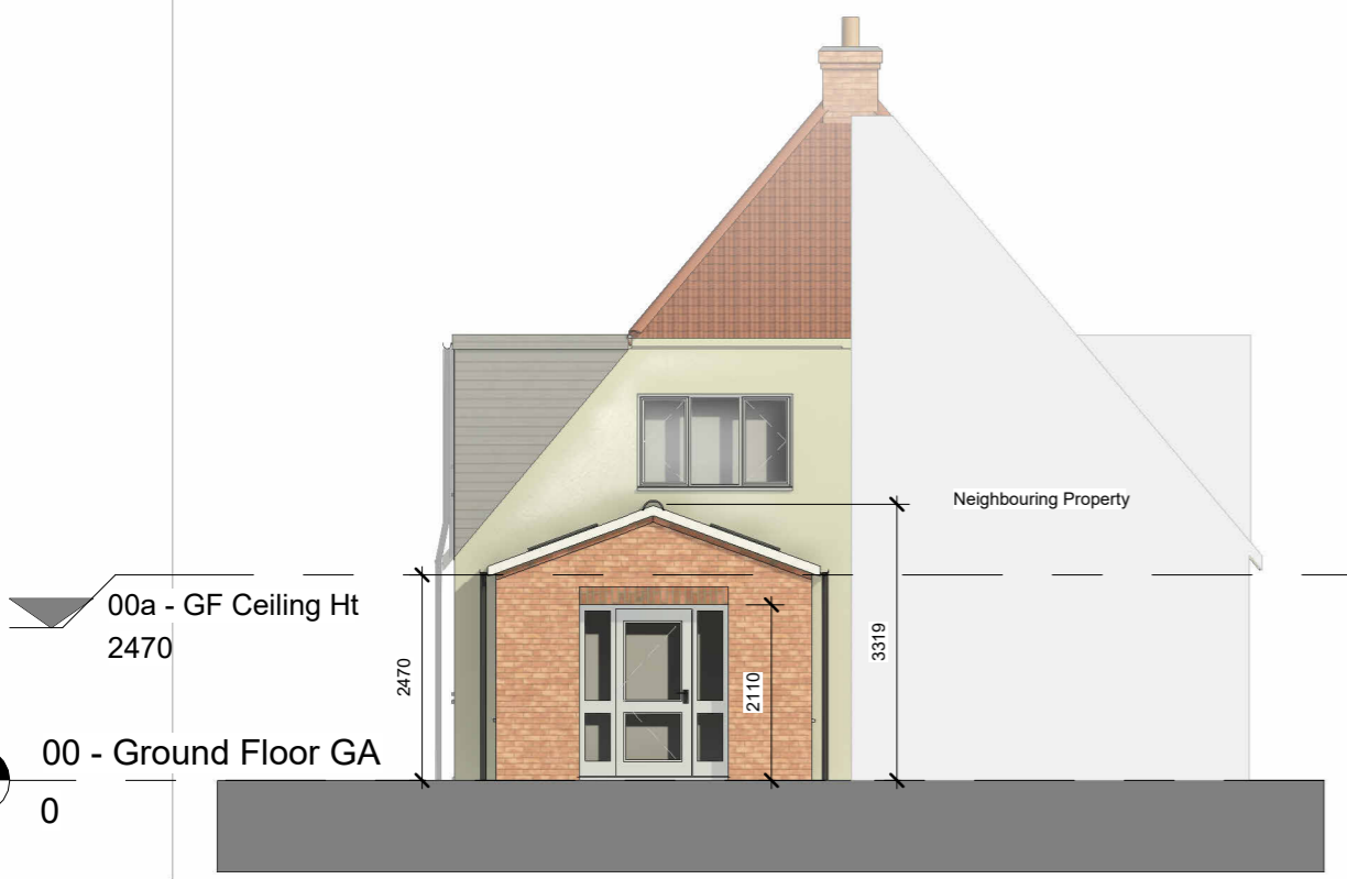
3 Proposed West Elevation 1 : 100