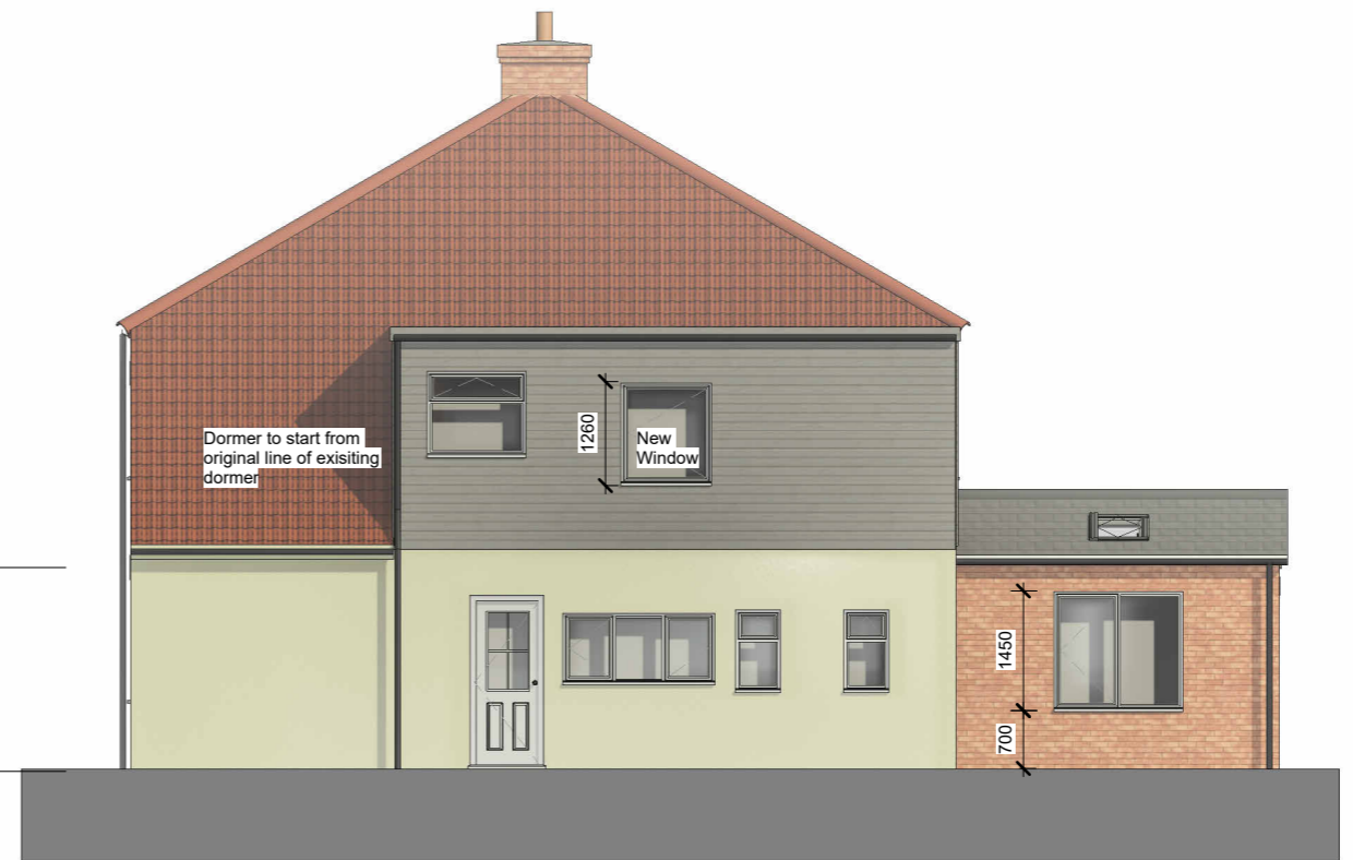
2 Proposed North Elevation 1 : 100