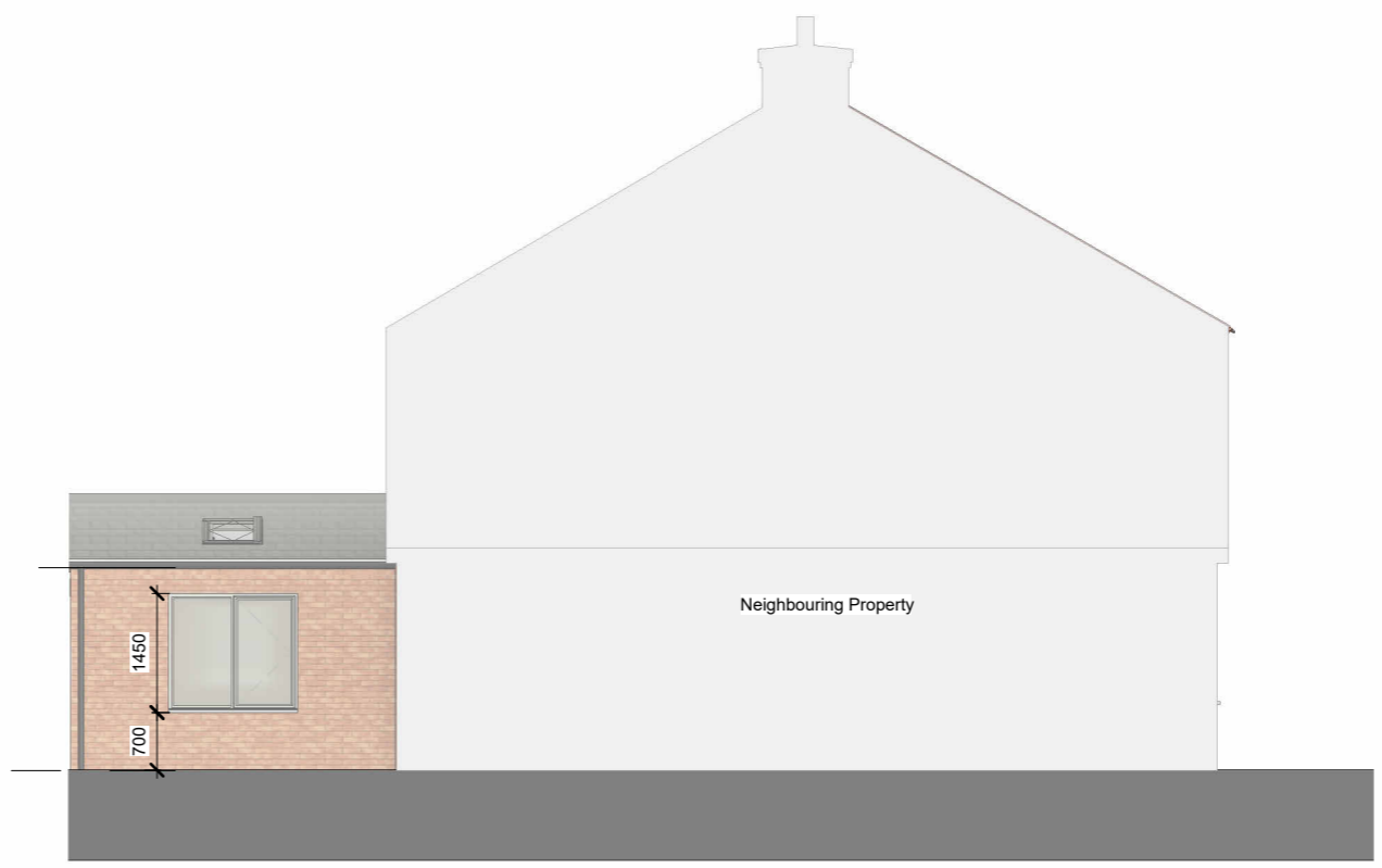
4 Proposed South Elevation 1 : 100