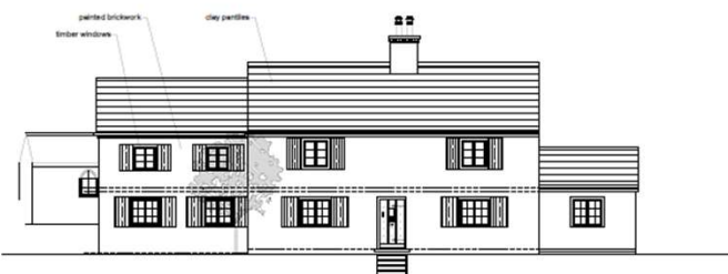
Proposed Main House Elevations 1:100