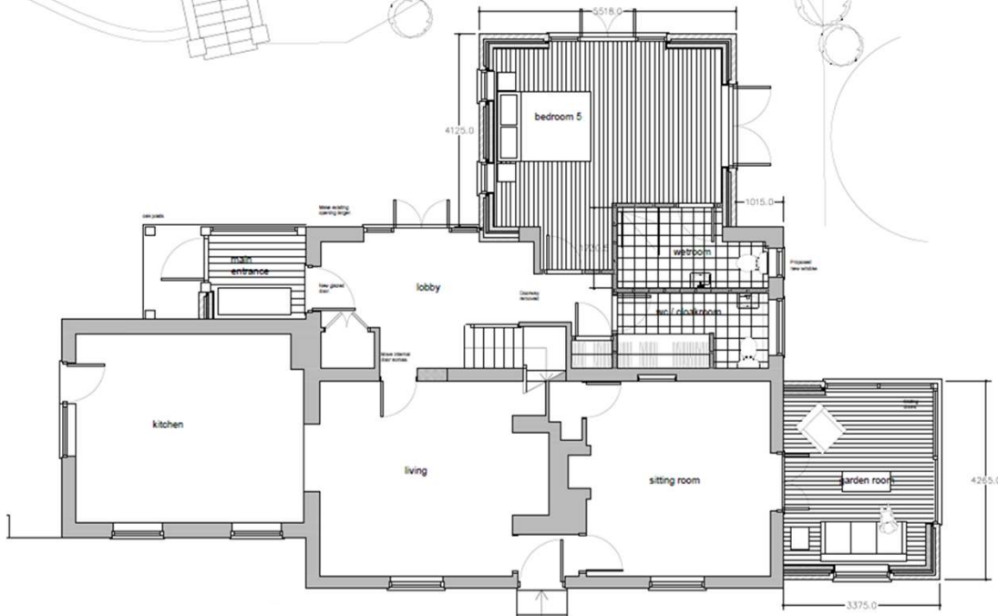
Approved Ground Floor Plan 1:50