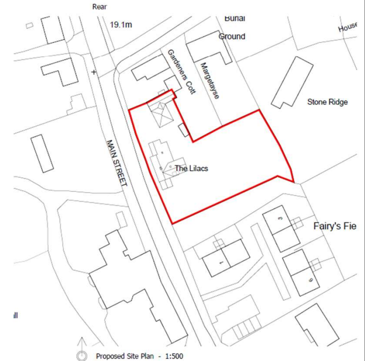
Proposed Site Plan - 1:500