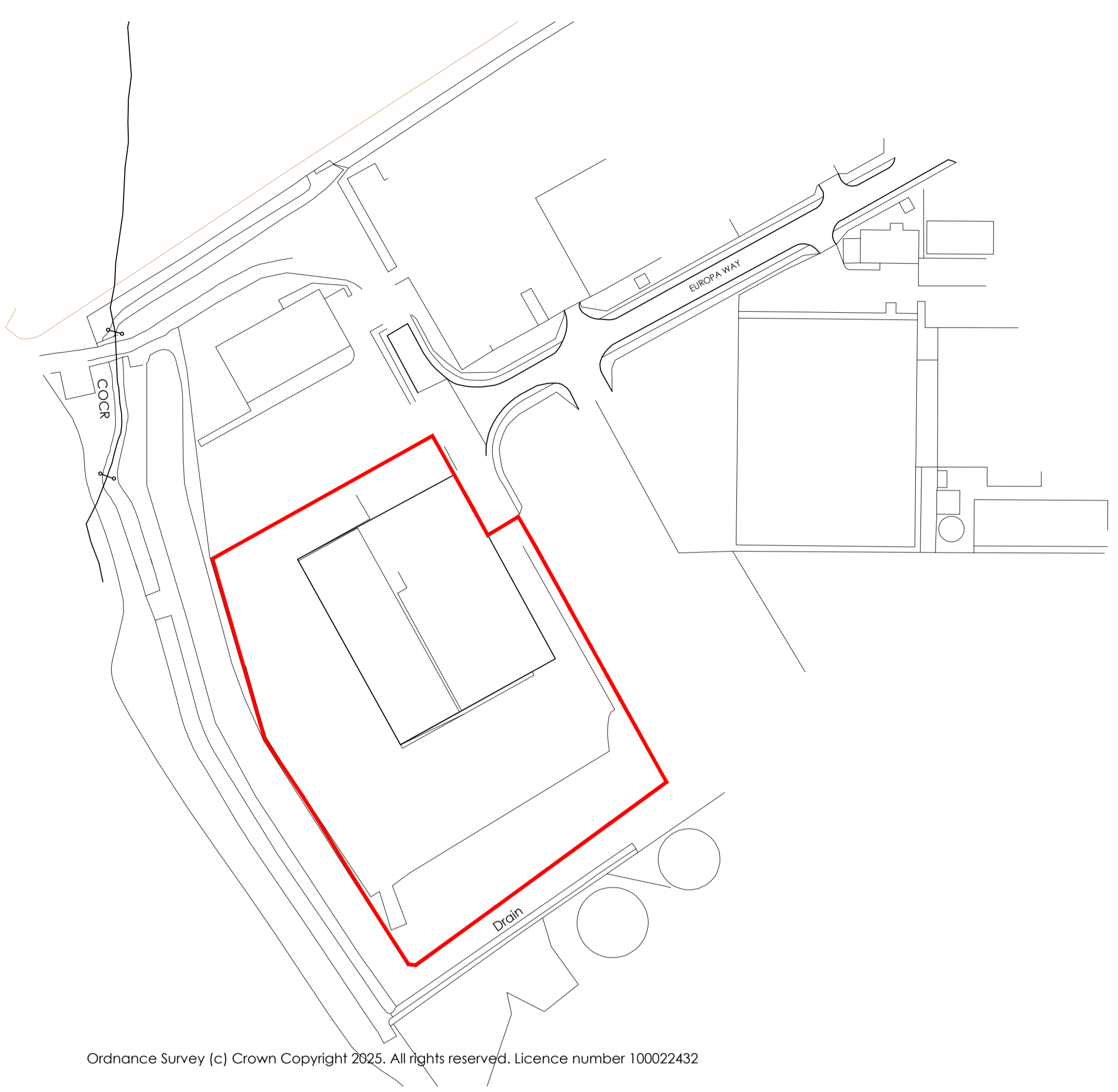
LOCATION PLAN scale 1:1250 - Site Area- 1.3 Ha