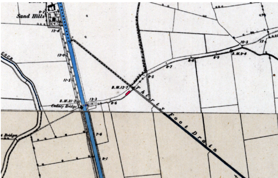
Above: OS six inch 1830s - 1880s (county layers) (hedge marked with small red lozenge)