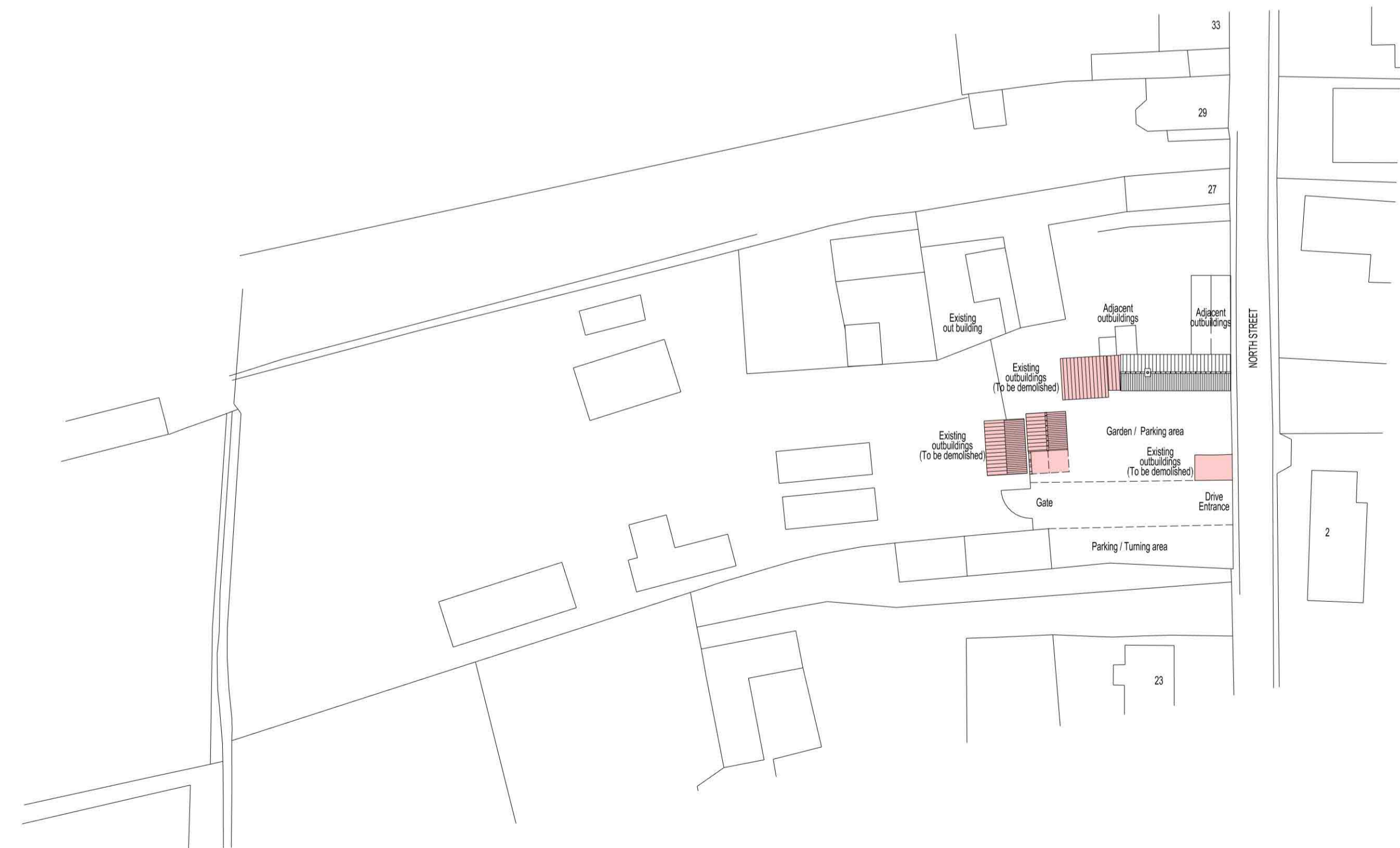
EXISTING SITE PLAN 1:500