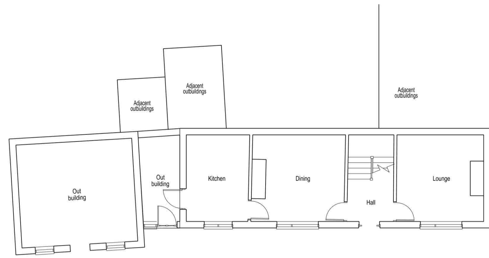
EXISTING GROUND FLOOR PLAN 1:100