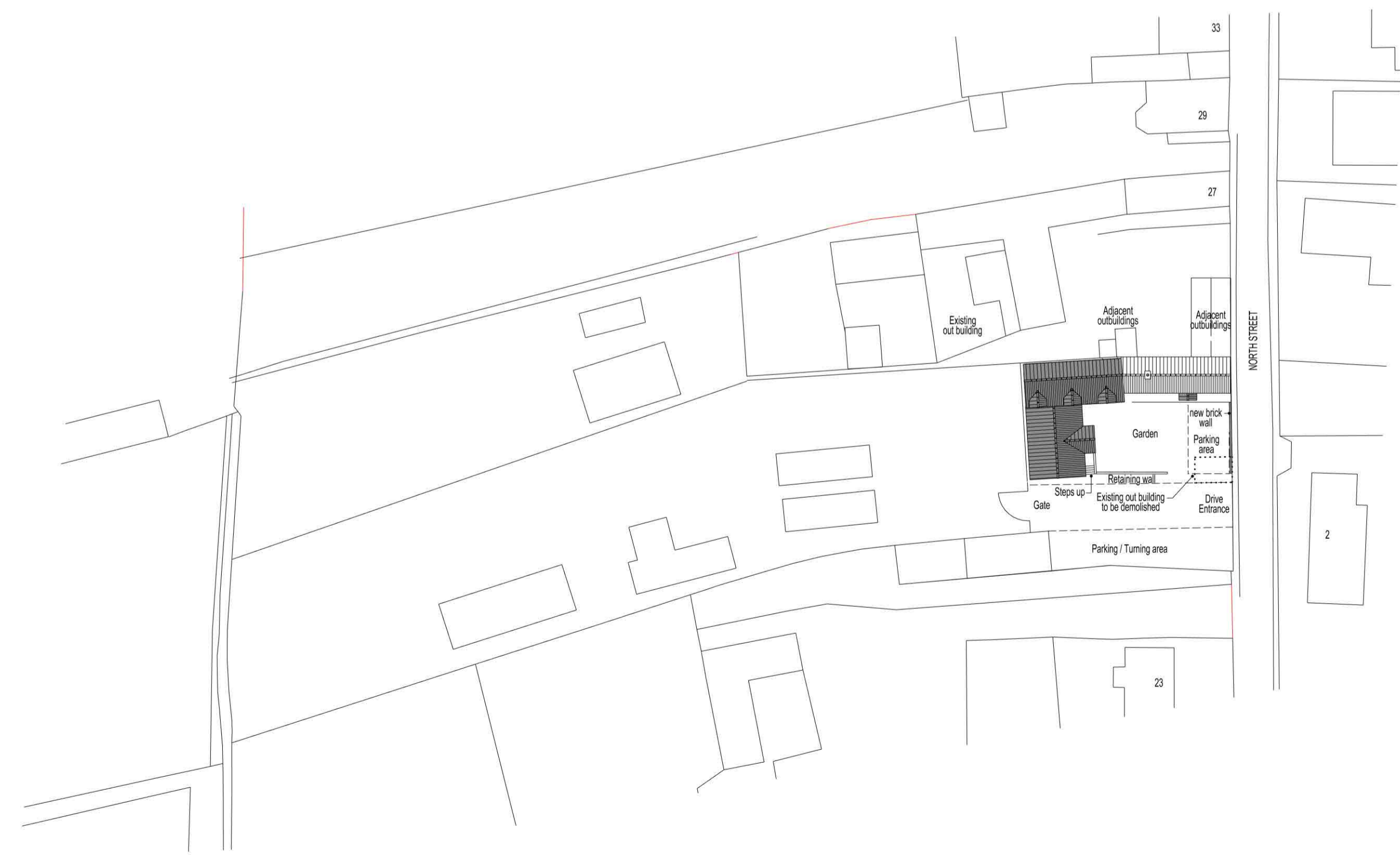
PROPOSED SITE PLAN 1:500