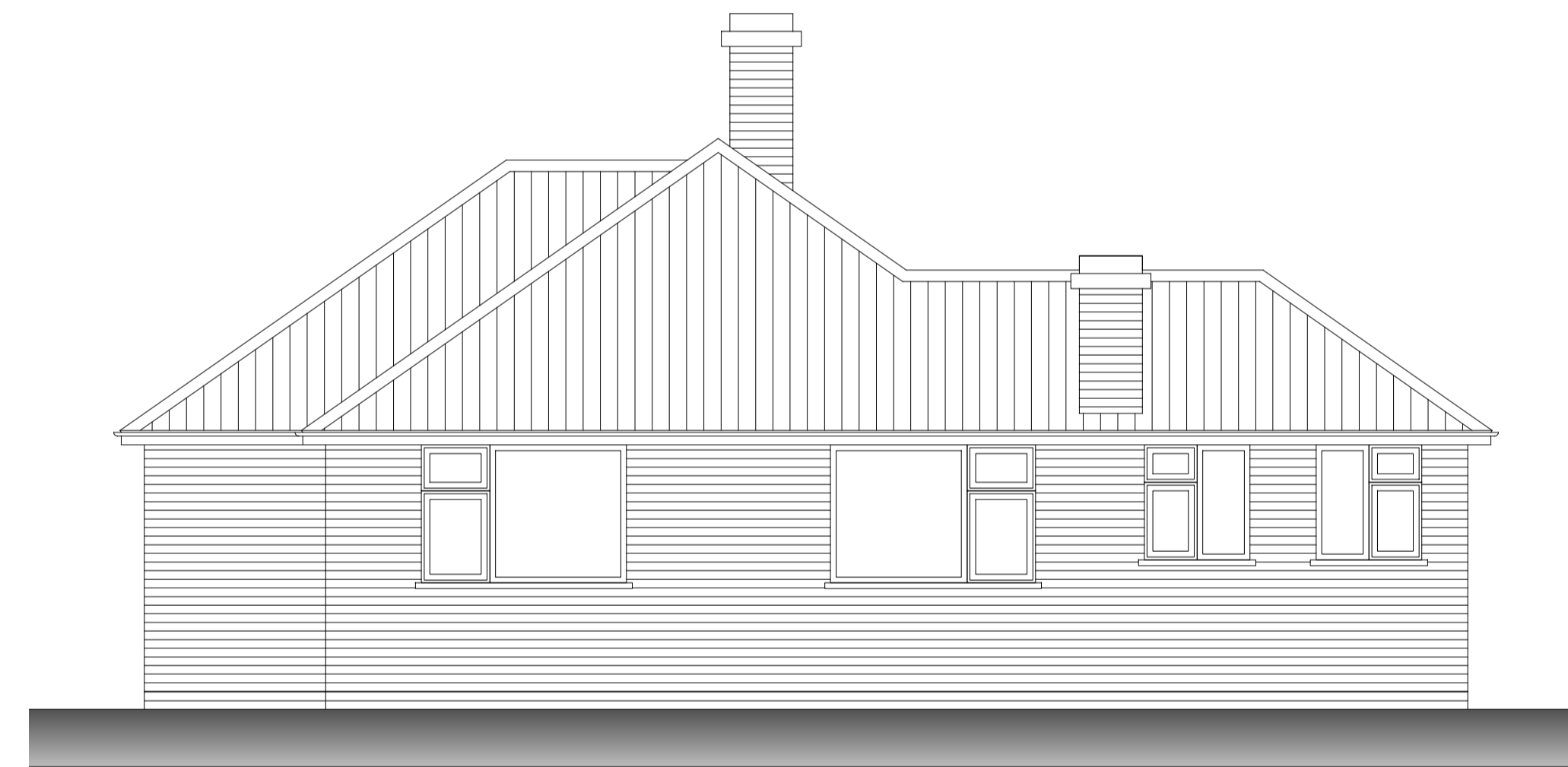
EXISTING SIDE ELEVATION - SCALE 1:50