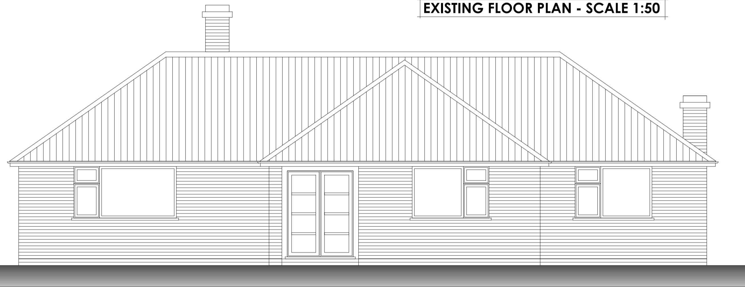
EXISTING FRONT ELEVATION - SCALE 1:50