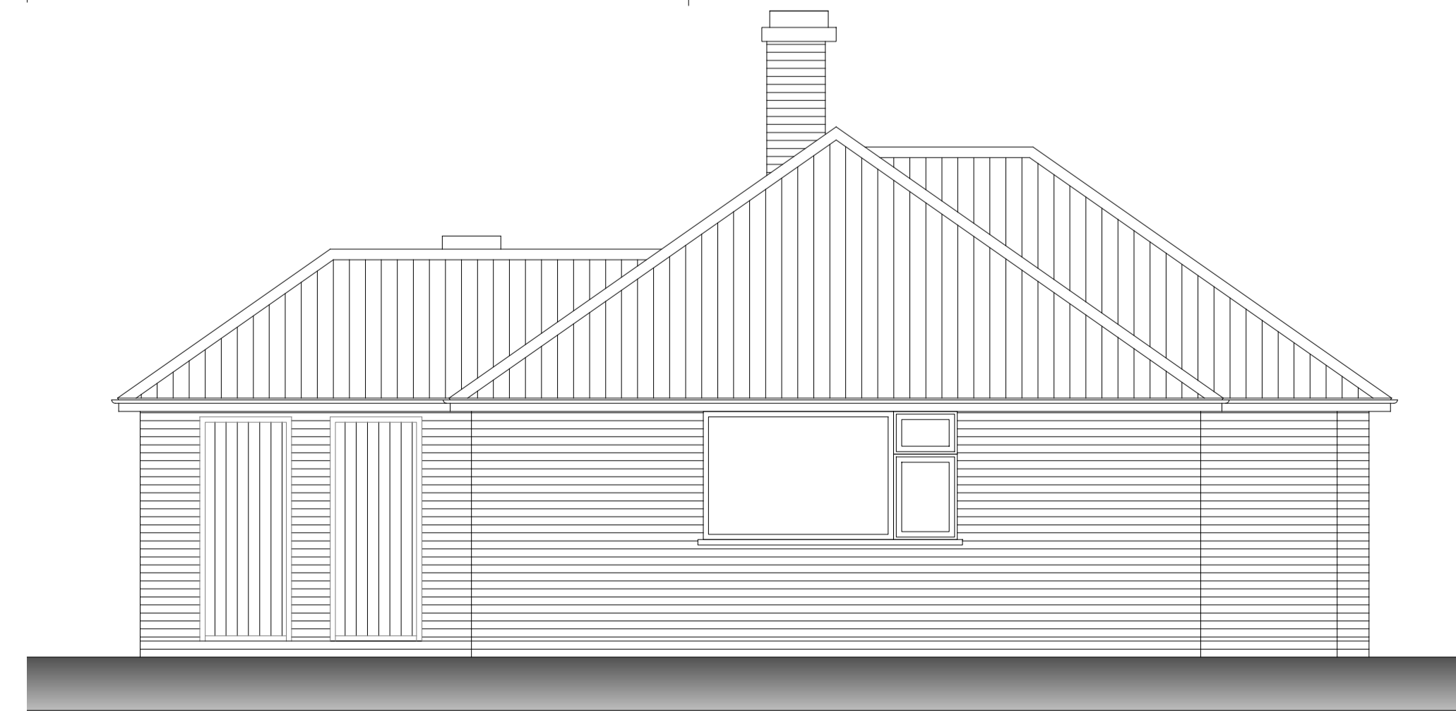
EXISTING SIDE ELEVATION - SCALE 1:50