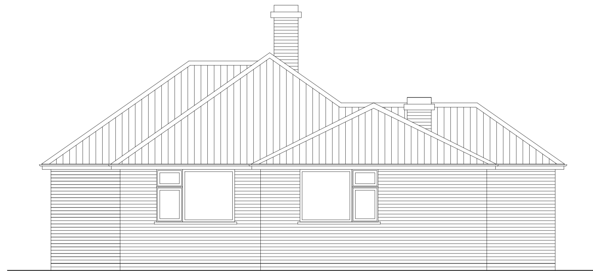
PROPOSED SIDE ELEVATION - SCALE 1:50