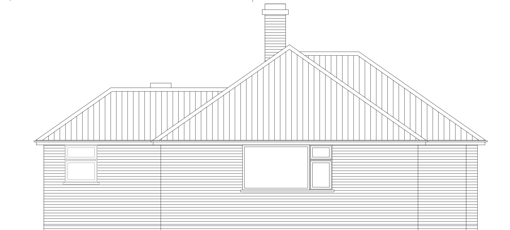
PROPOSED SIDE ELEVATION - SCALE 1:50