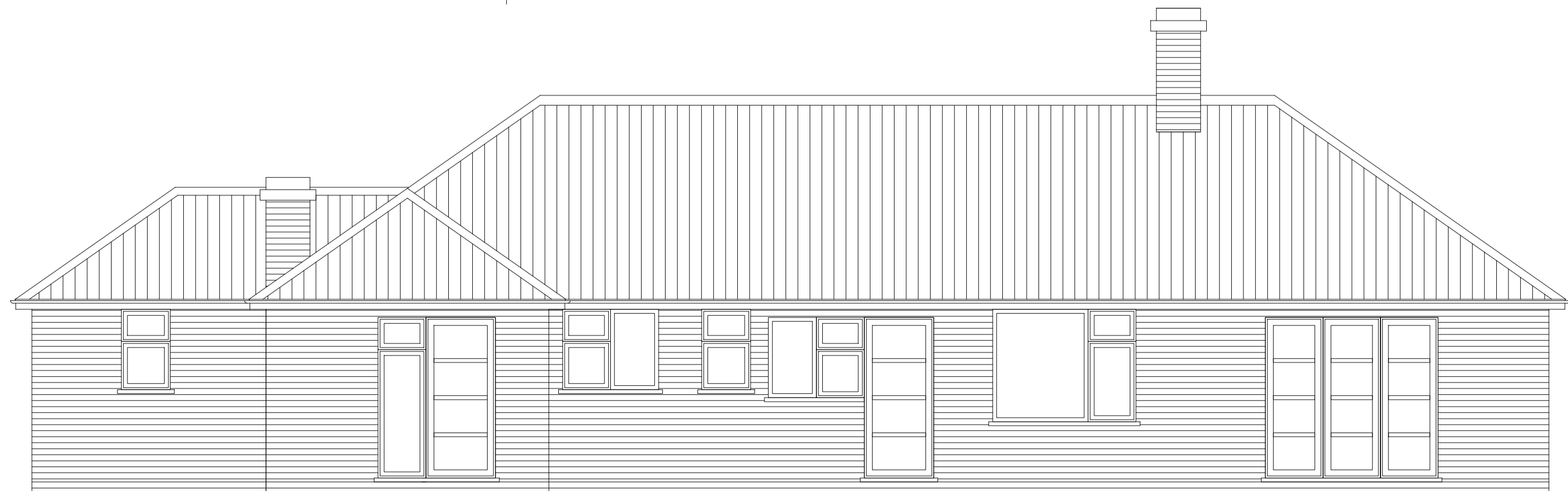
PROPOSED REAR ELEVATION - SCALE 1:50