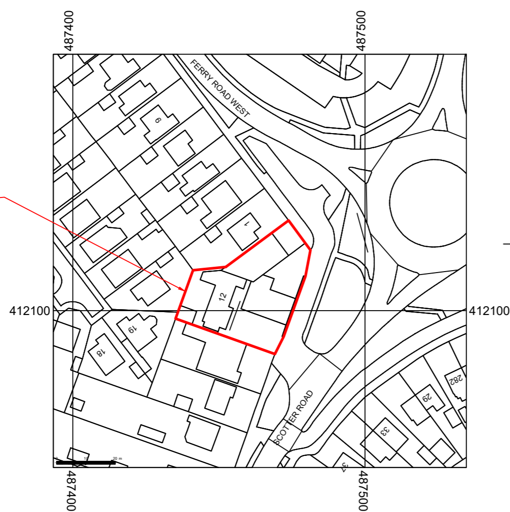
LOCATION PLAN 1:1250@A1 1:2500@A3 os map licence no. 10047474 Crown copyright 2025