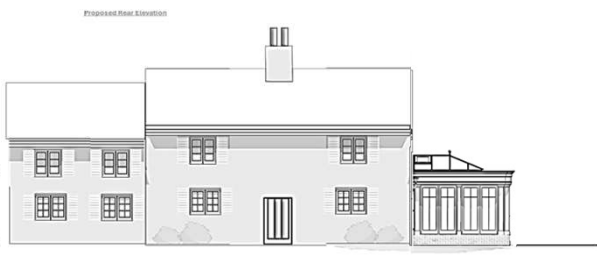
Proposed Main House Elevations 1:100 Front