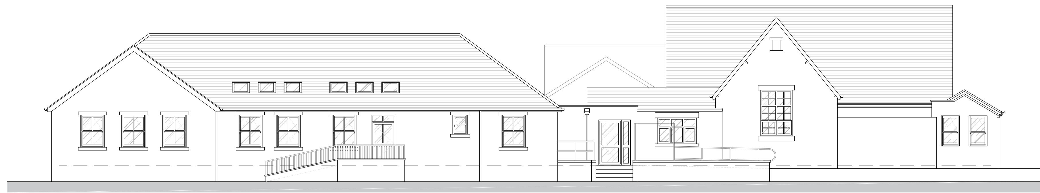
WEST ELEVATION | SCALE 1:100