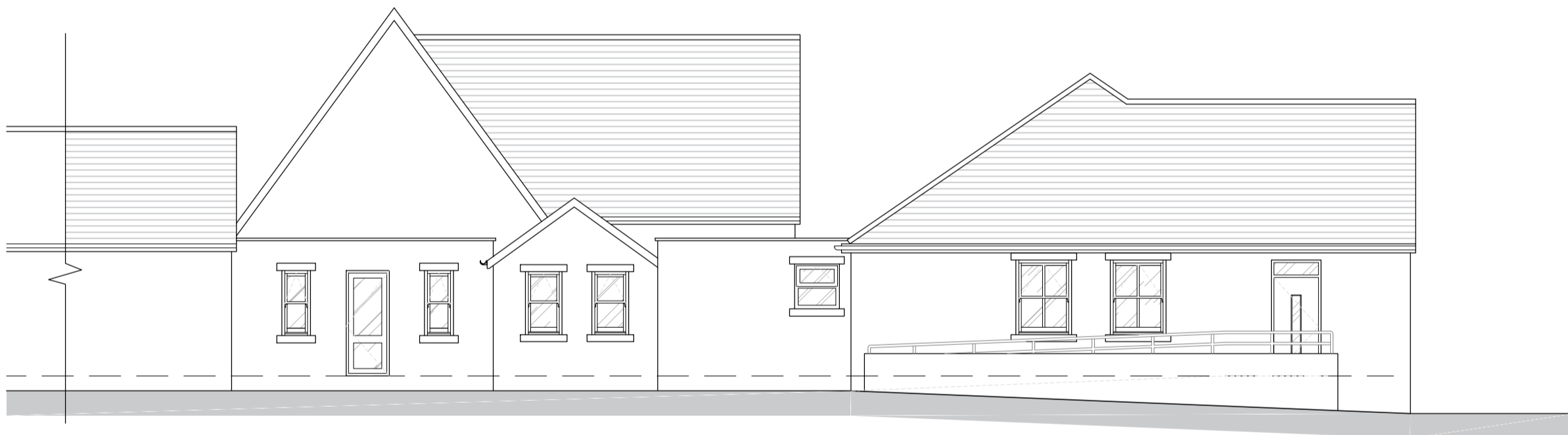
NORTH ELEVATION | SCALE 1:100