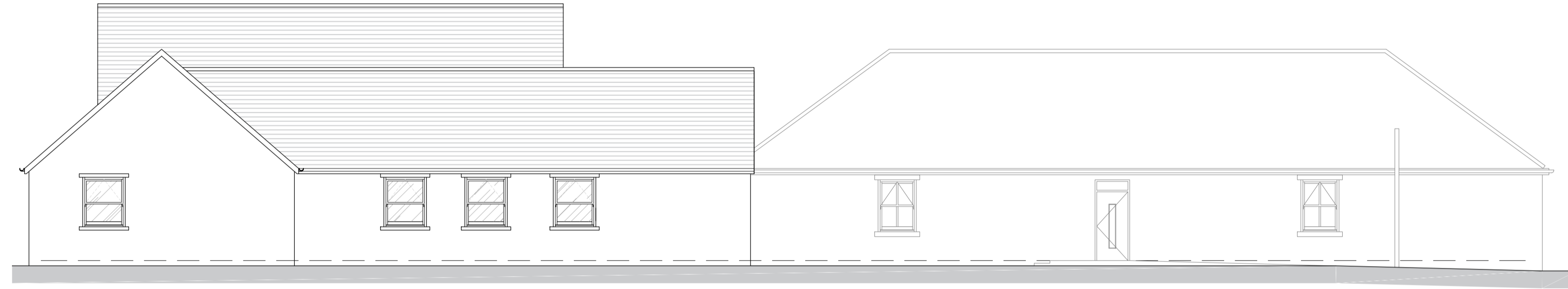
EAST ELEVATION | SCALE 1:100