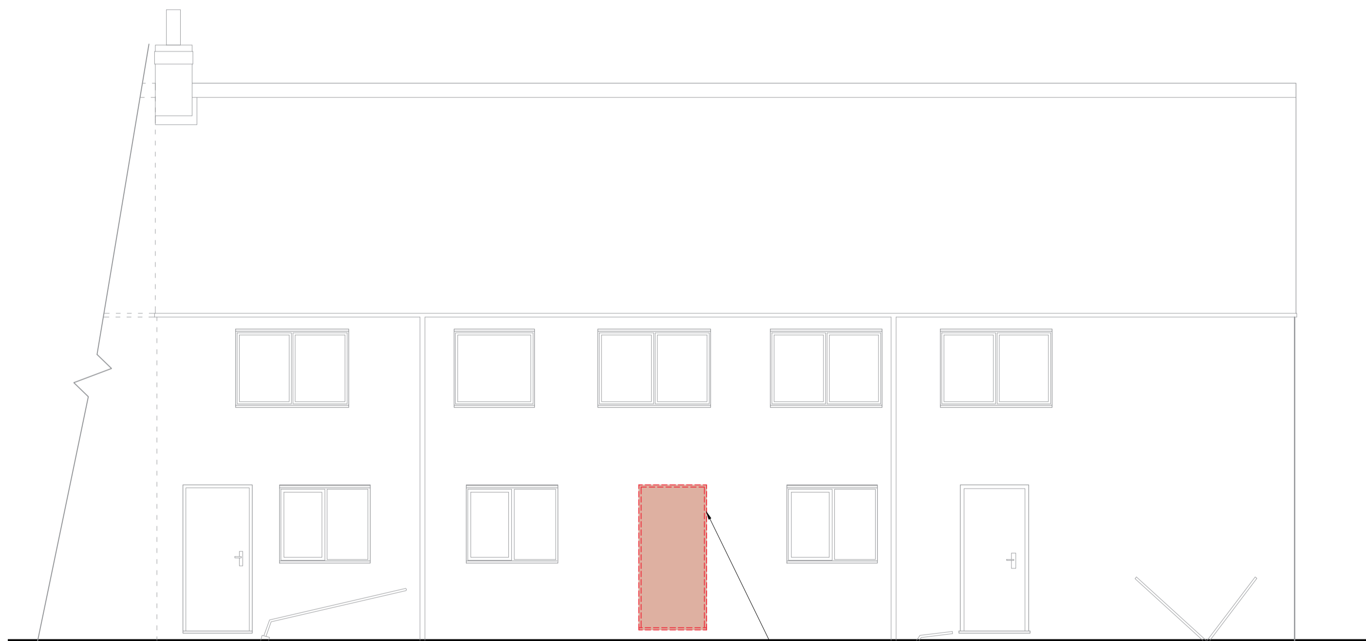
North Elevation SCALE 1:50

Existing external door and frame removed and opening bricked up all to match existing wall.