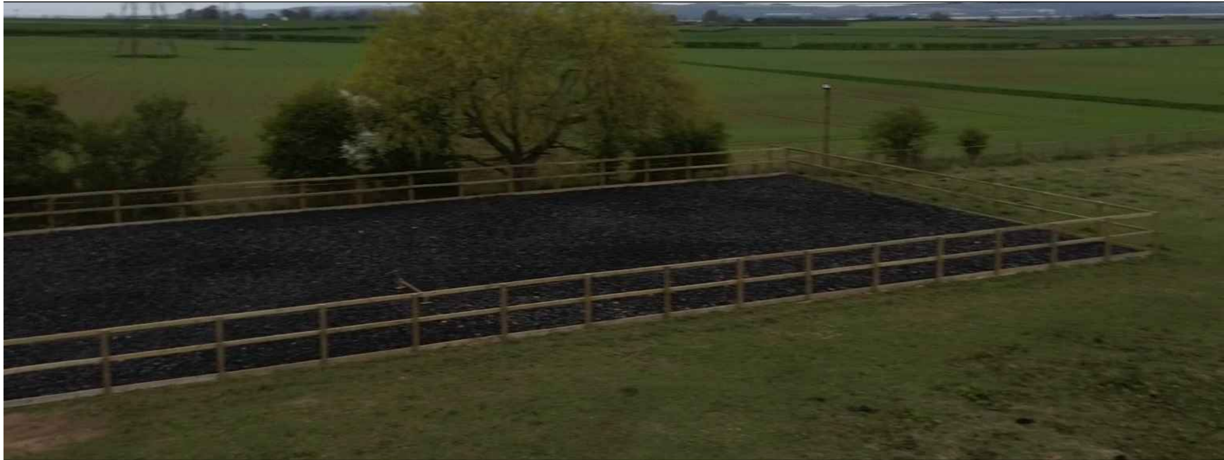
Photograph of exerciser NTS.