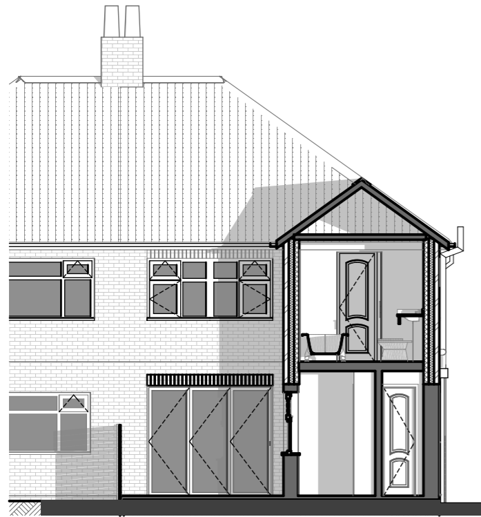
02 PROPOSED SECTION A-A Scale 1:100