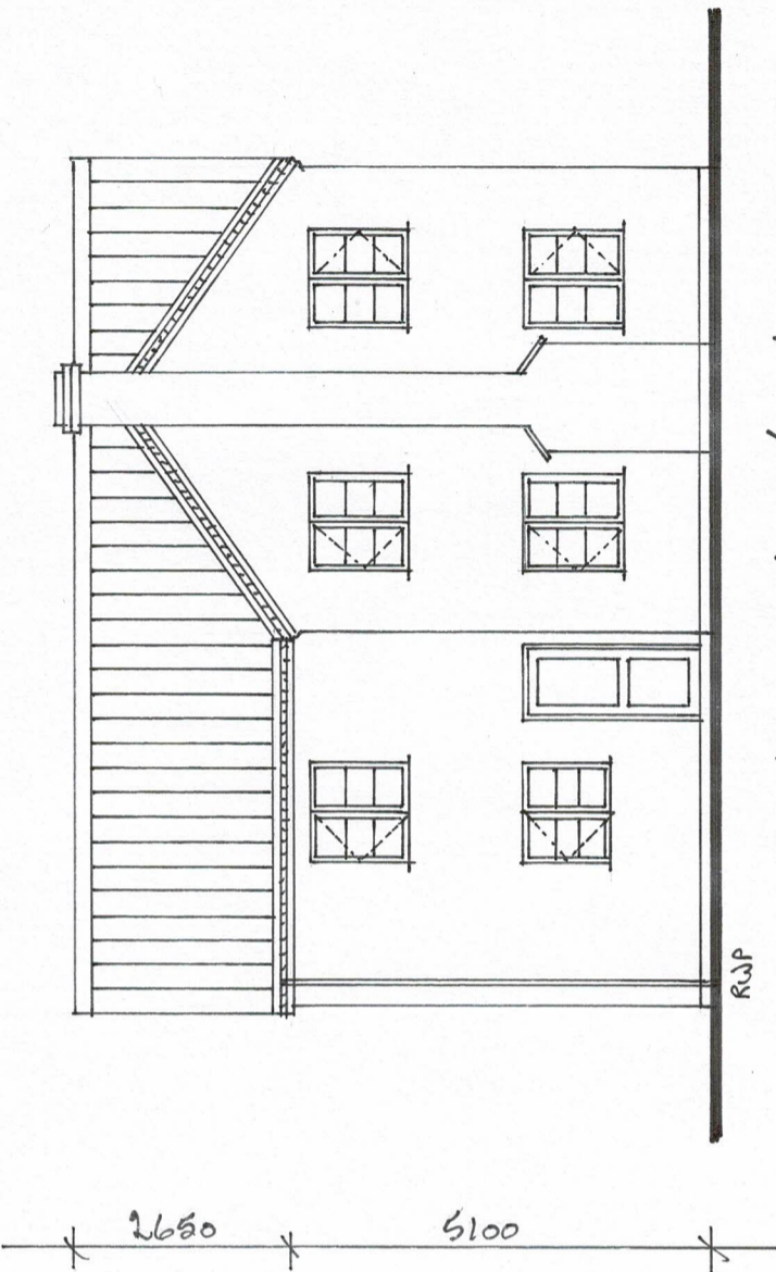
SOUTH ELEVATION (REAR)